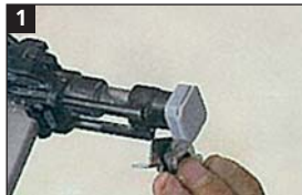
Fix on the nailer nose.