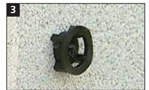
Basebrid installed: insert the cable tie and fix.