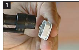
Fix on the nailer nose.