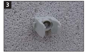
3 Ready to clip.