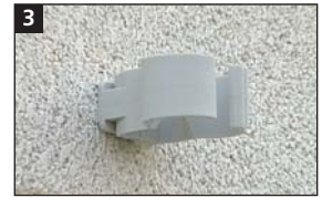
Ready to clip.