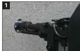
Fix on the nailer nose.