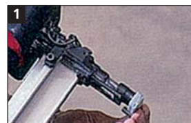
Fix on the nailer nose.