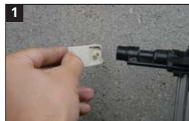
Fix on the nailer nose.