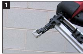
1 Fix on the nailer nose.