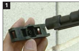
Fix on the nailer nose.