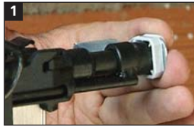
Fix on the nailer nose.