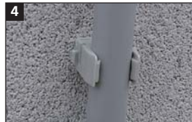
4 Installation ready.