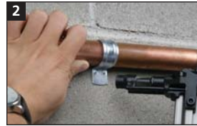
Shot on the clip.