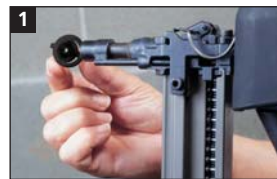
Fix on the nailer nose.