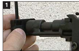
Fix on the nailer nose.