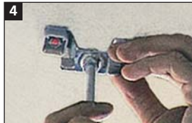
Ready to install the rod.