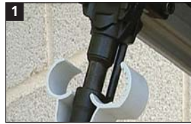
Fix on the nailer nose.